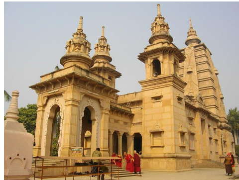
Figure 1(b) Sarnath Temple

https://upload.wikimedia.org/wikipedia/commons/4/49/A_Buddhist_temple_at_Sarnath.jpg