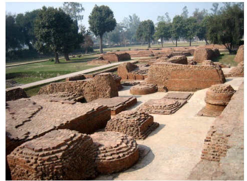
Figure 1(c) Stupa Ruins in Kushinagar

https://upload.wikimedia.org/wikipedia/commons/9/99/Stupa_ruins_in_Kushinagar.jpg