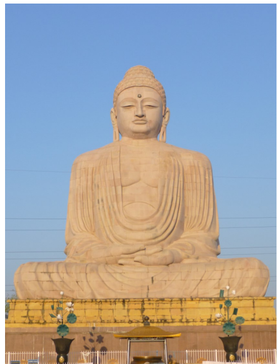
19.507m tall Great Buddha statue in Bodhgaya

https://upload.wikimedia.org/wikipedia/commons/1/17/Bodh_Gaya_-_Buddha_Statue_-_Front_View_%28289224970905%29.jpg