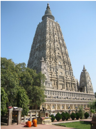
Figure 1(a) Mahabodhi Temple in Gaya

https://upload.wikimedia.org/wikipedia/commons/4/4e/Mahabodhitemple.jpg