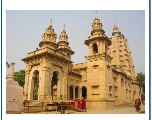
https://upload.wikimedia.org/wikipedia/ commons/4/49/ A Buddhist temple at Sarnath.jpg